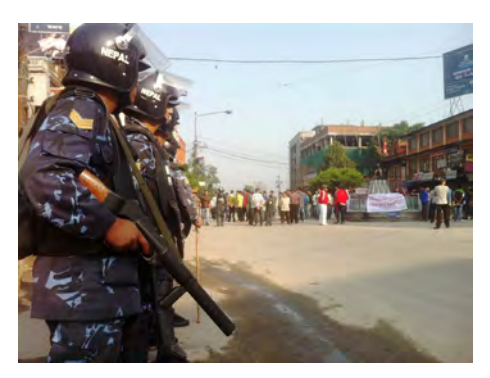
Security guards waiting for the arrival of anti-government protestors.

There are even rumors swirling that the failure of the constituent assembly was part of a larger Maoist plot to seize total control. If UCPN-Maoist and the Madhesi Party had split before the Constituent Assembly expired, Bhattarai would have been forced to resign, but instead both splits occurred within a few weeks after the Constituent Assembly