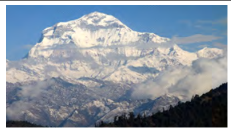
Dhaulagiri Himal from the Nangi Hills Trek

Spring time in the Himalaya... The Nangi Hills Trek is unlike the standard, run-of-the-mill mountain treks in Nepal. This is a great trek for volunteers – and