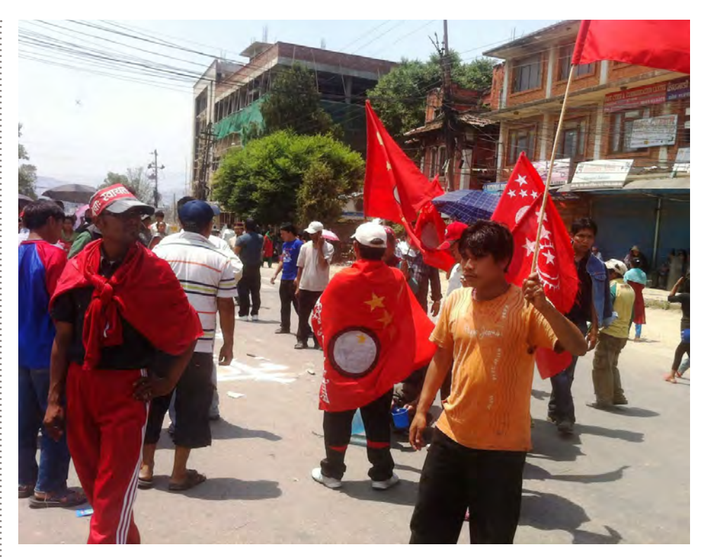
Youth march to protest the lack of progress in writing the constitution.

The failure of the 1990 democratic movement achievements, the royal massacre, and King Gyanendra's power grab galvanized an opposition movement that came to be known as Loktantra Andolan II (Democratic Movement II). Led by the seven major political parties and supported by the Maoists, the Andolan forced Gyanendra on 24 April 2006 to