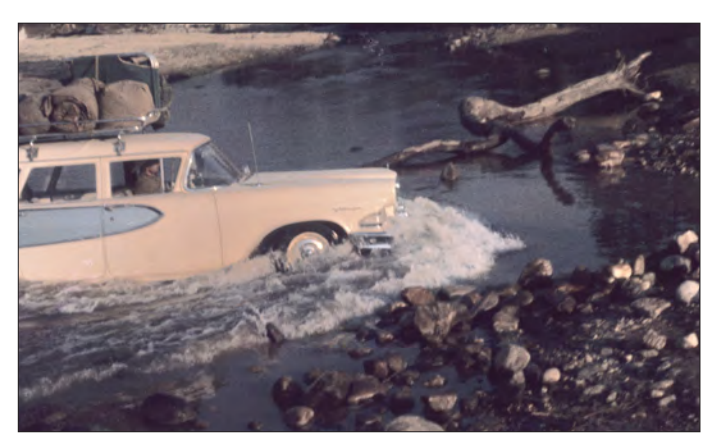
Fording a stream en route to Kathmandu, 1960.